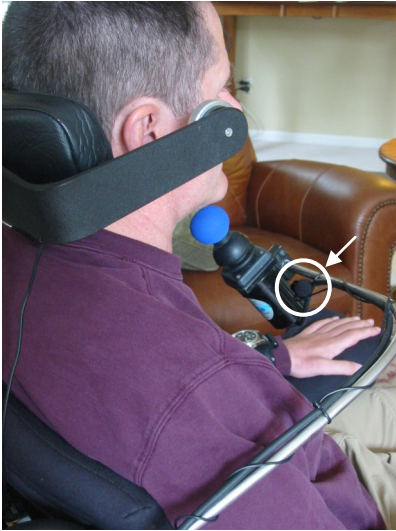
Wireless Microphone for Voice Control Throughout the Home or Office